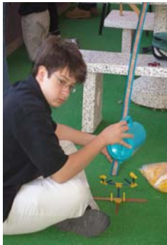
Rube Goldberg Day

For about 15 years I was a principal in APS at the Career Enrichment Center. If the toilets clogged up, I called Maintenance and Operations, now I call a plumber. If the garbage didn't get picked up, I called the Facilities Department, now I call the Dumpster guy. Before, I had the time to casually think lofty thoughts about educational trends...now I run around like a rabid gerbil...glamorous hub!