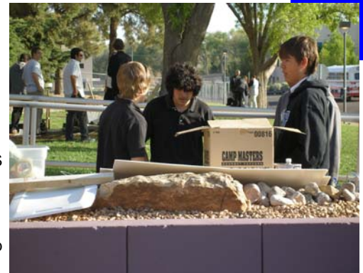
A fine demonstration of dress code!

or white collard shirt, or any "AIMS Wear" is fine. PANTS (Beige or black) MUST FIT AT THE WAIST! No one wants to see a 4'5", 80 lb kid in pants made for a 6'4" 300 lb man! On Fridays, students may wear denims, with a dress code top or Red Lobo wear in honor of Lobo Red Friday! We will have the AIMS wear available for purchase at the meet and greet on August 21, along with examples of what is acceptable or not! For more detail, go to the www.aims-unm.org website and pull down the family-student contract. Now folks, I urge you to embrace your parental power here...I know its tougher than once my daughter has gotten in the car dressed like an insane rodeo clown. And yes