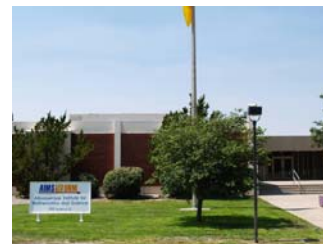
Our Home Away From Home

As for student drop off in the morning and pick up in the afternoon, we are asking parents to enter the park on Bradbury St from Avenida Cesar Chavez, drop their children off at the AIMS lot, and then continue on Bradbury to Baseheart to exit